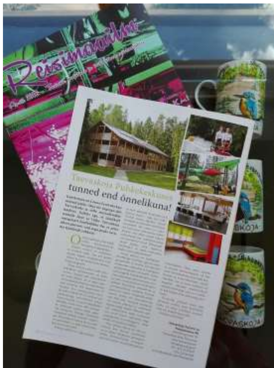
Article in the magazine „Reisimaailm“ (in Estonian)

https://spark.adobe.com/video/ELk8qx9WvgnQd